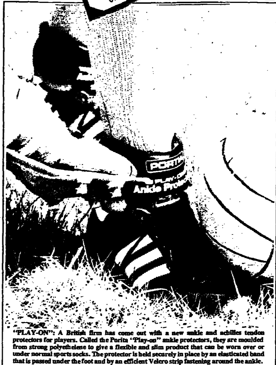
"PLAY-ON": A British firm has come out with a new ankle and achilles tendon protectors for players. Called the Porita "Play-on" ankle protectors, they are moulded from strong polyethylene to give a flexible and slim product that can be worn over or under normal sports socks.

dominated the rest of the bout. "He gave me a great fight, he had courage all the time. He was the best southpaw I've ever seen."